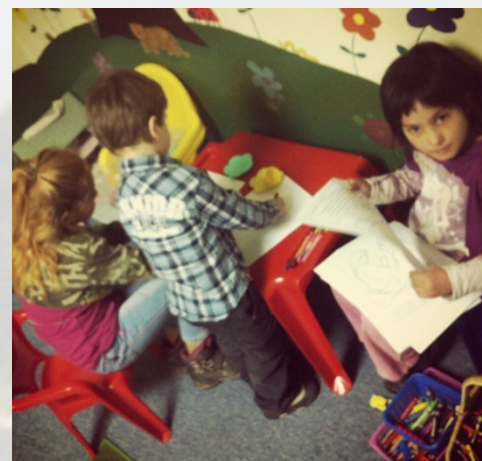
From the church nursery in Varaždin. The little boy is a Croatian national, and the two little girls are gypsies from one of the local villages.